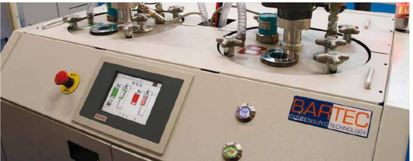
触摸式感应开关, 液位传感器 SENSORswitch, Fluid Sensor