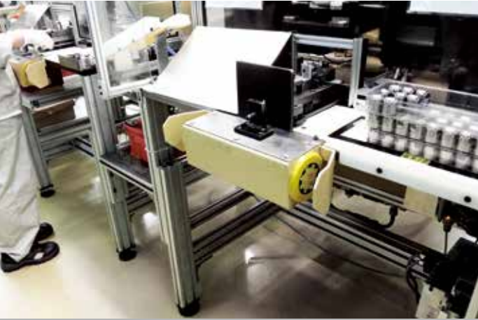
双手安全开关, 叉形光电传感器 Safecap, Optical Sensor