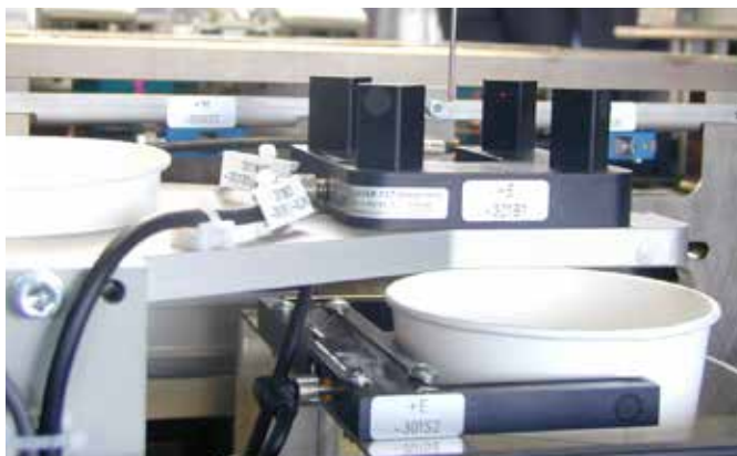
TCP激光检测单元, 液位传感器 TCP-Laser Unit, Fluid Sensor