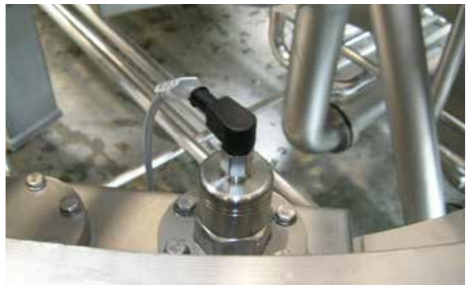
液位传感器 Fluid Sensor